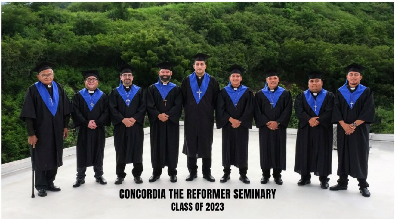
CONCORDIA THE REFORMER SEMINARY CLASS OF 2023